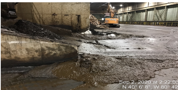
Sep 2, 2020 at 2:22:03 N 40° 6' 8", W 80° 42' 1001 M