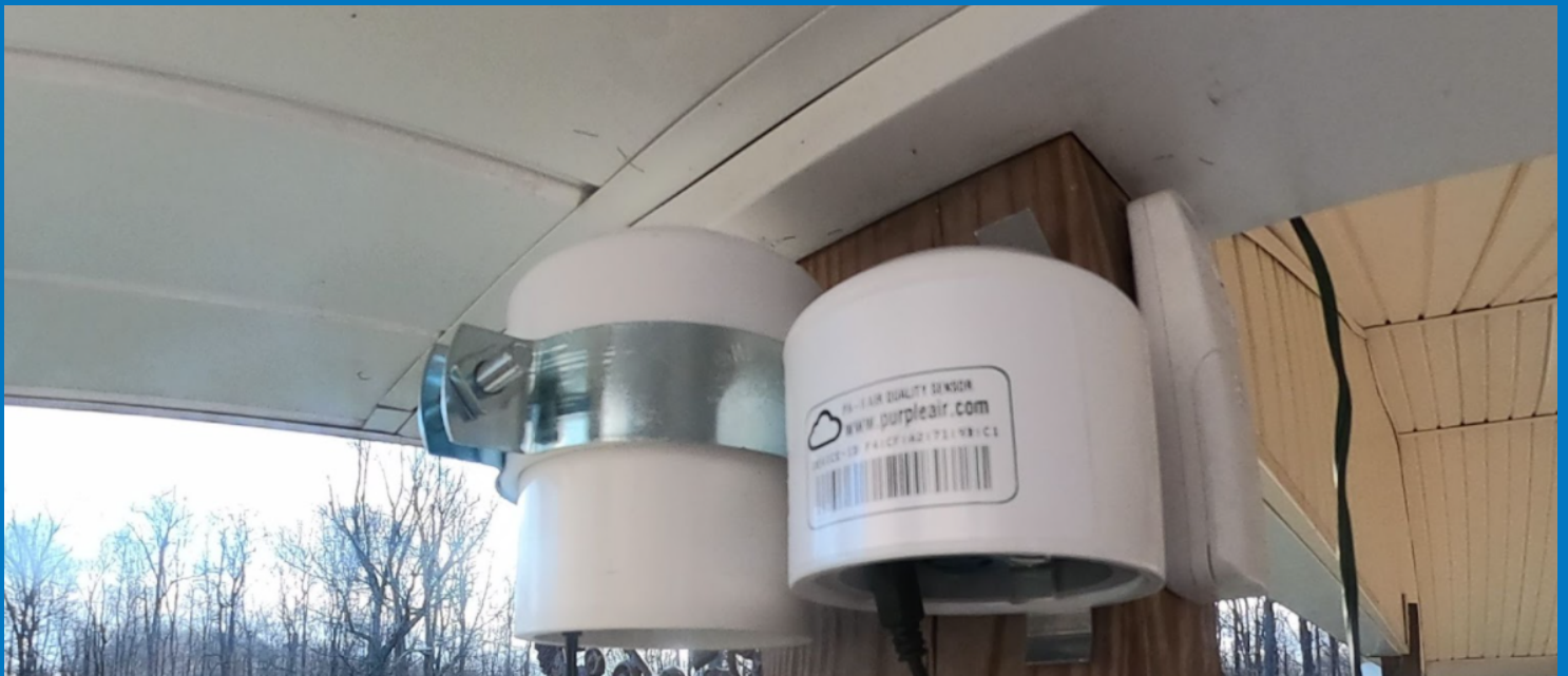
Particulate matter and a volatile organic compound air monitor installed at a resident's home.