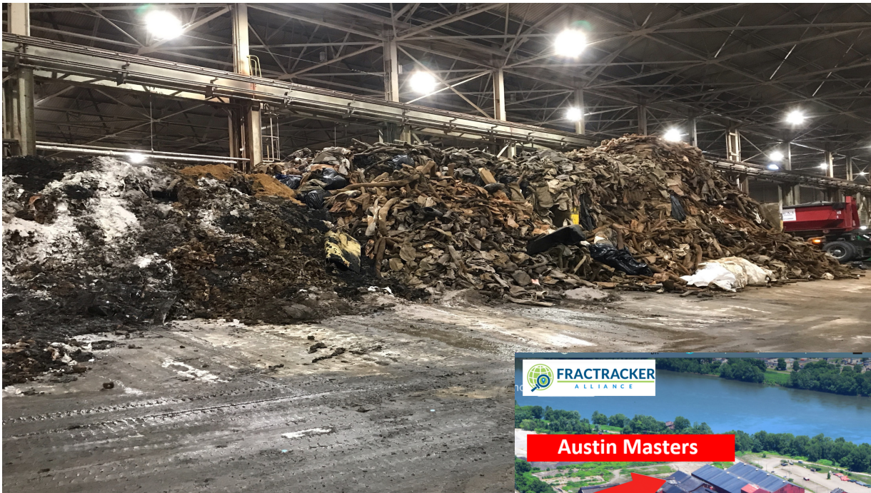
Ohio Dept of Natural Resources inspection report, Sept. 2020

Meetings are being held by residents who get their water from Martins Ferry and who are concerned about the threats posed by the Austin Masters facility. Please reach out to us if you are interested in joining us in this campaign. If you would like to help continue CORR's work in Martins Ferry, consider donating . All funds raised will go directly to helping protect the drinking water of Belmont County residents.