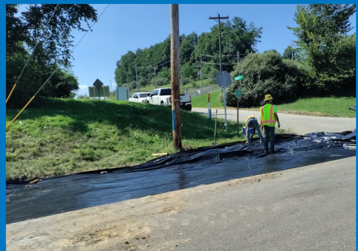
First day of clean-up on injection well spill on Rt. 800 ->